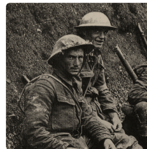
Britain at War